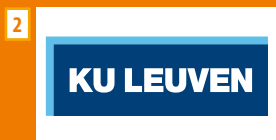
KU Leuven Leuven, Belgium